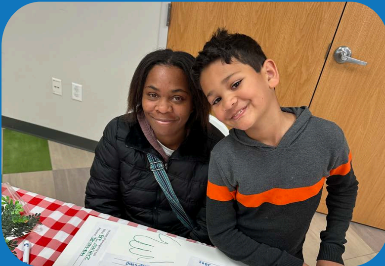
Friends of the Children Utah's Strengthening Families initiative.