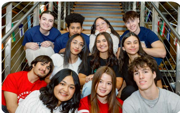
Call to Action 2024 scholarship recipients (Utah and Idaho)

In addition to financial aid, our Scholars receive access to mentorship, academic counseling, leadership development, and personal and professional support. Since 2007, we have awarded over $7 million in scholarships to students in need.