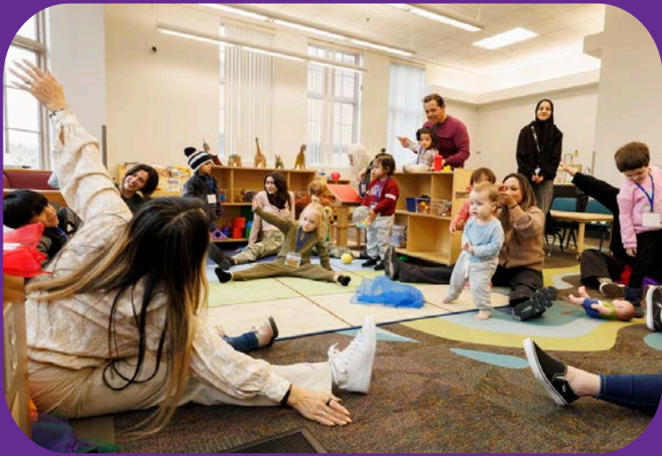
Utah's Promise and South Salt Lake's Baby & You program.