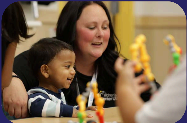
The Children's Center Utah's Therapeutic Preschool Program.